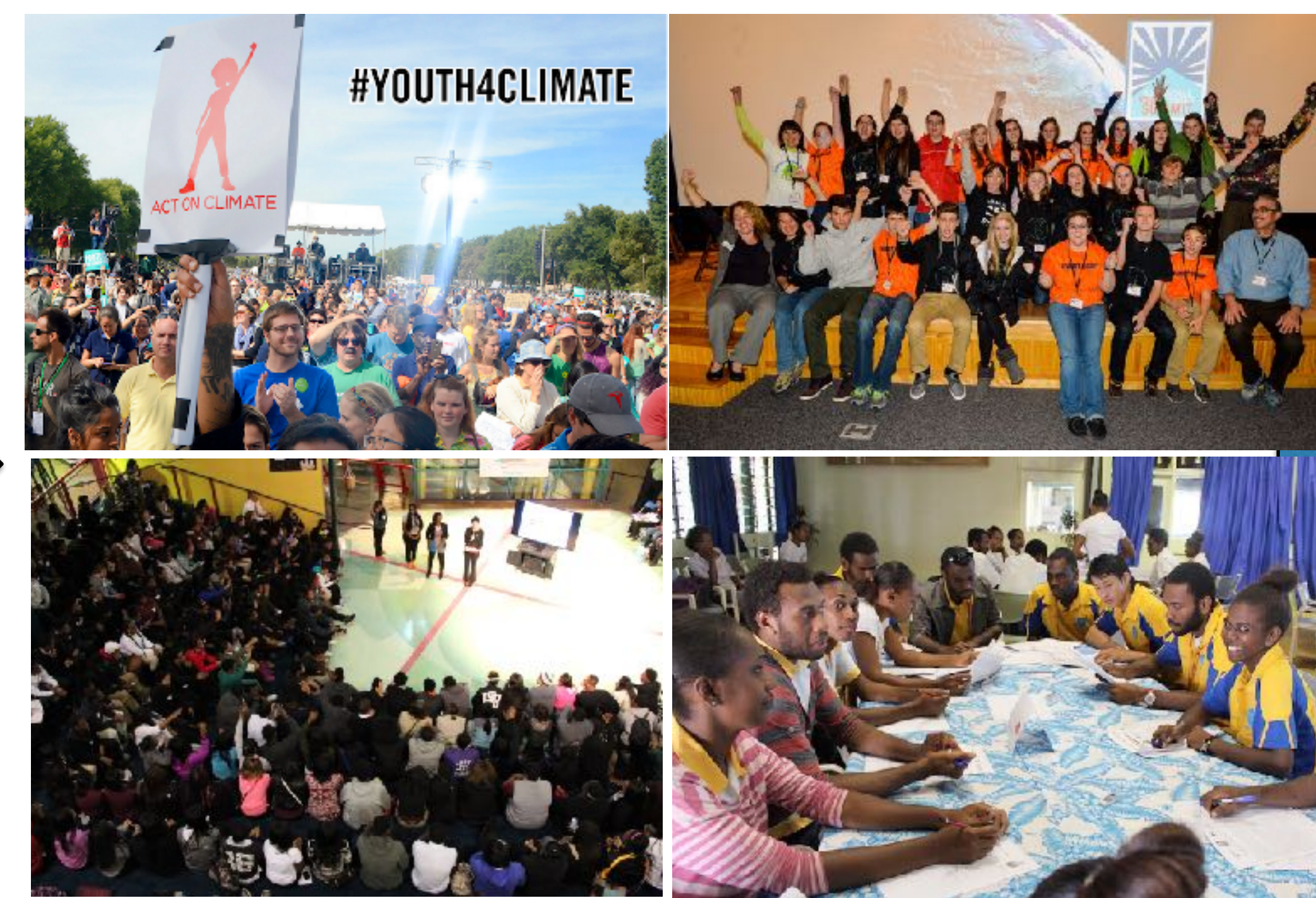
Climate Youth Engagements building to COP21 (CELI commitments