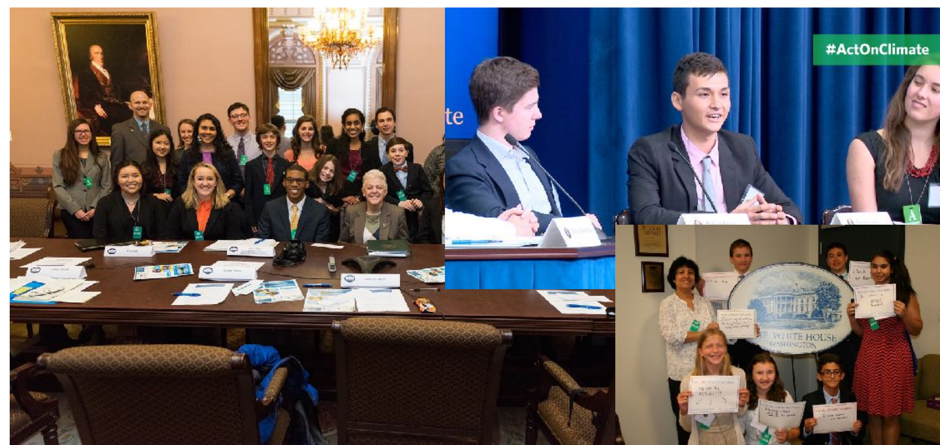
White House Climate Education and Literacy Initiative (CELI) youth engagements

Climate Youth Engagement in the United States have significantly increased since the President Obama White House, U.S. Federal agencies and wider community expanded the number and diversity of climate and energy education programs