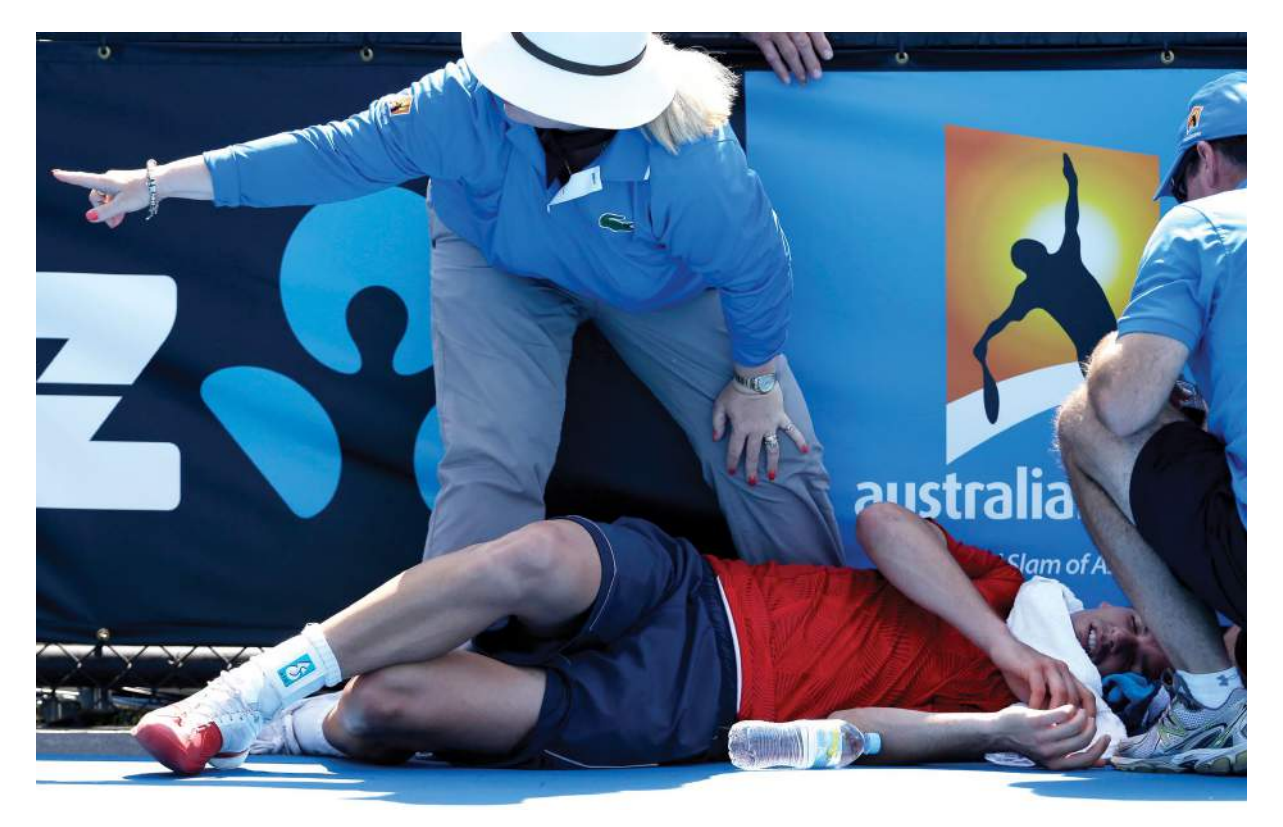
Frank Dancevic of Canada lies on the court after collapsing during his first round match against Benoit Paire of France as temperatures topped at 43°C at the Australian Open on January 14, 2014.

Four consecutive days of temperatures above 41°C during an already hot summer saw part of the 2014 Australian Open dubbed "hot as hell" by media.<sup>79</sup> One of the world's biggest tennis tournaments, heavily attended and watched on TV by millions across the world, became notorious for the unbearable conditions in which athletes and spectators found themselves.