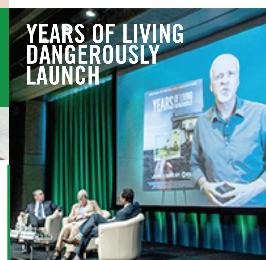
YEARS OF LIVING DANGEROUSLY LAUNCH