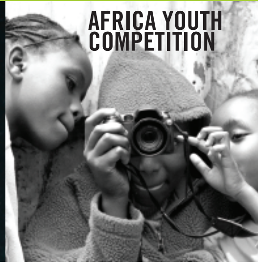
AFRICA YOUTH COMPETITION