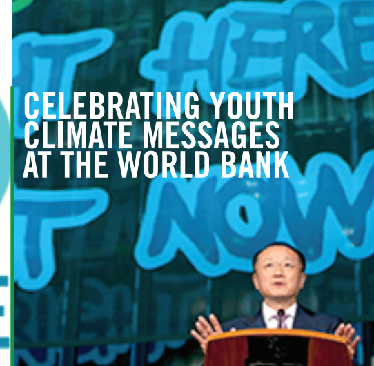
CELEBRATING YOUTH CLIMATE MESSAGES AT THE WORLD BANK