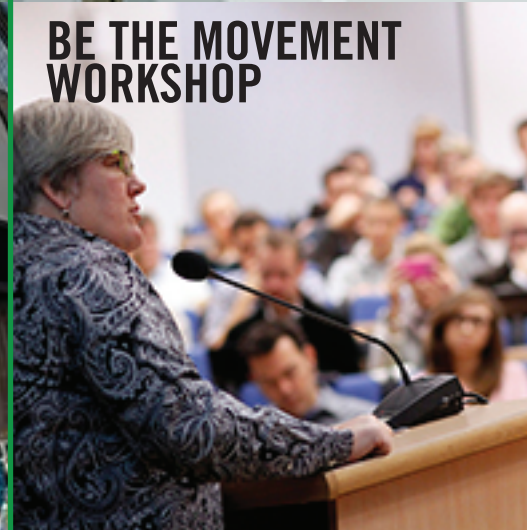
BE THE MOVEMENT WORKSHOP