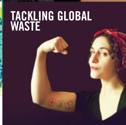
TACKLING GLOBAL WASTE