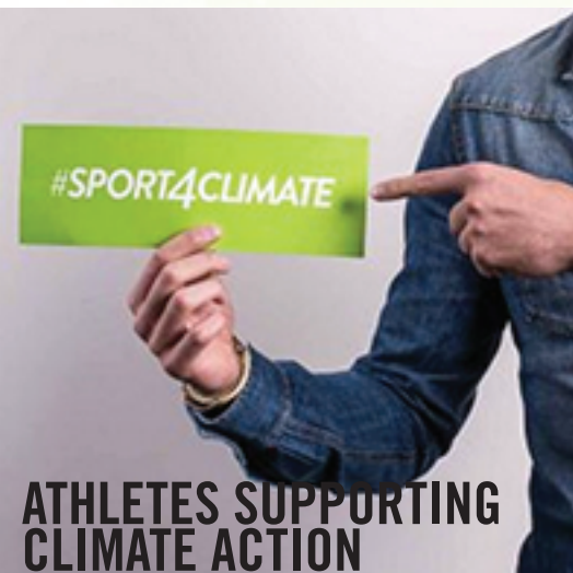
ATHLETES SUPPORTING CLIMATE ACTION