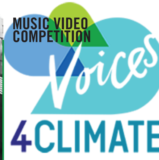
MUSIC VIDEO COMPETITION