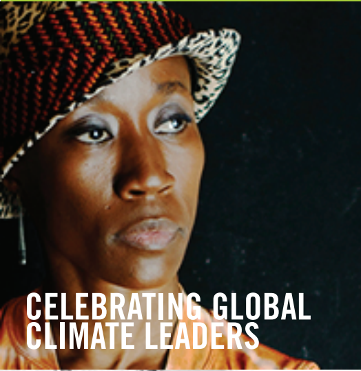
CELEBRATING GLOBAL CLIMATE LEADERS