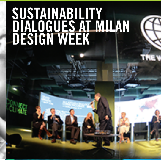
SUSTAINABILITY DIALOGUES AT MILAN DESIGN WEEK