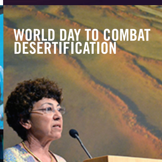
WORLD DAY TO COMBAT DESERTIFICATION