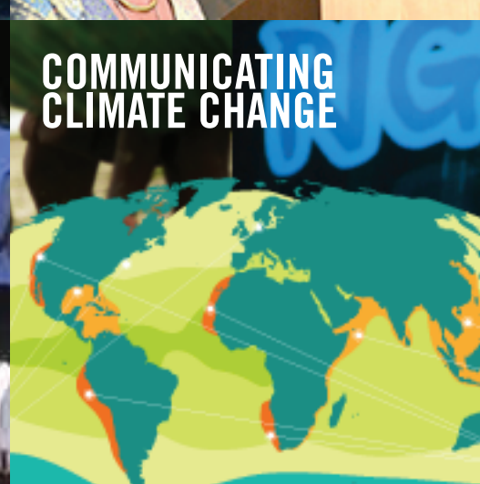
COMMUNICATING CLIMATE CHANGE