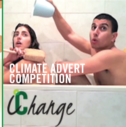
CLIMATE ADVERT COMPETITION