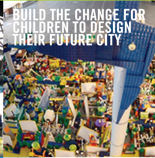
BUILD THE CHANGE FOR CHILDREN TO DESIGN THEIR FUTURE CITY