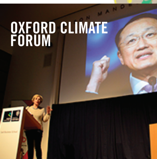
OXFORD CLIMATE FORUM