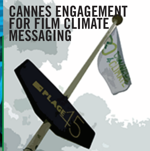
CANNES ENGAGEMENT FOR FILM CLIMATE MESSAGING