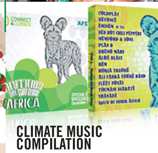
CLIMATE MUSIC COMPILATION