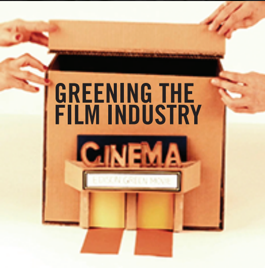
GREENING THE FILM INDUSTRY