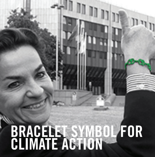
BRACELET SYMBOL FOR CLIMATE ACTION