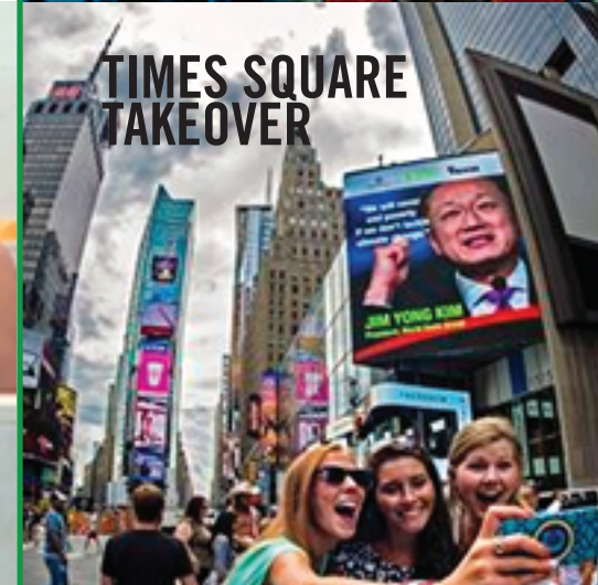
TIMES SQUARE TAKEOVER