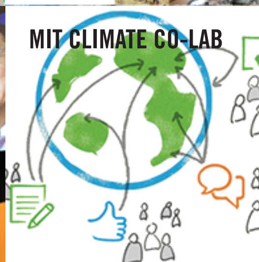
MIT CLIMATE CO-LAB