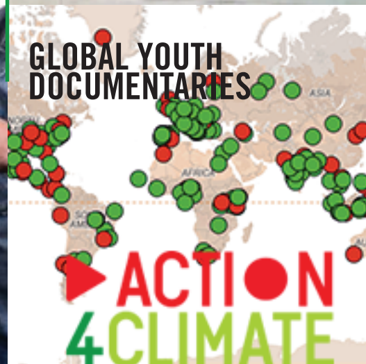
GLOBAL YOUTH DOCUMENTARIES