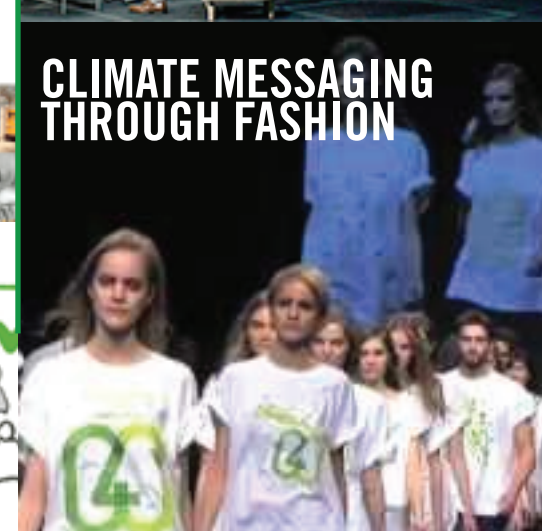
CLIMATE MESSAGING THROUGH FASHION